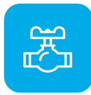
NATURAL GAS PIPING